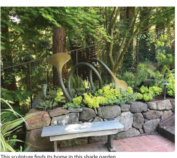
This sculpture finds its home in this shade garden