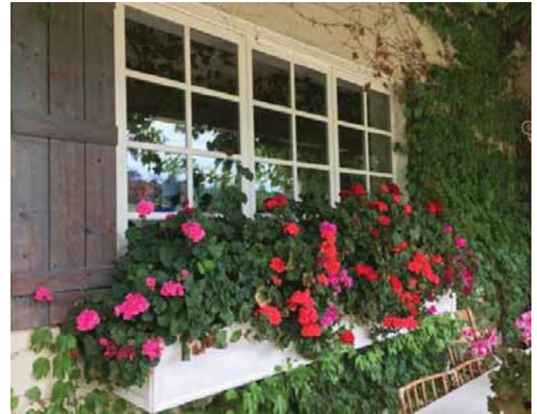
Geranium-filled window boxes