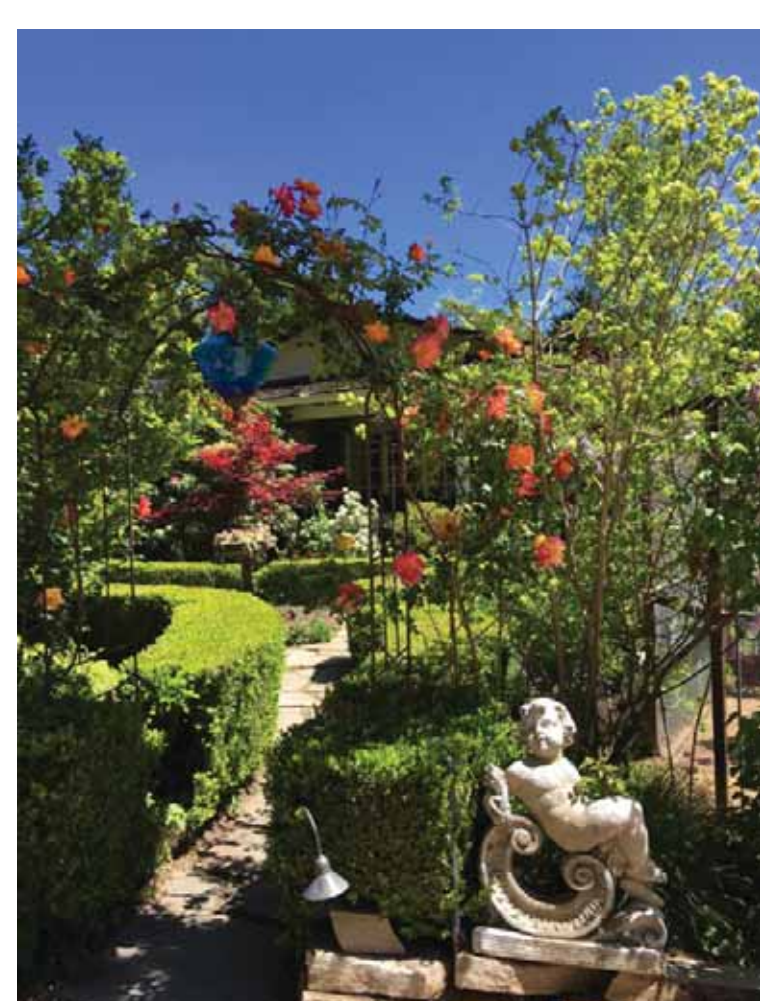
Roses climb this antique arbor